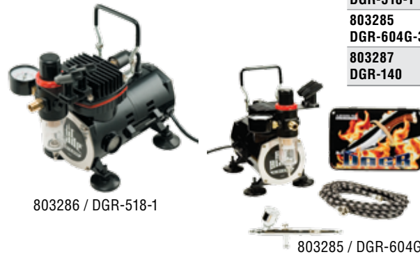
803286 / DGR-518-1