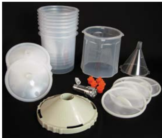
803130 / DPC-654

Order No. 803510 Model No. DPC-503-K24 (Kit of 24 cups & lids)