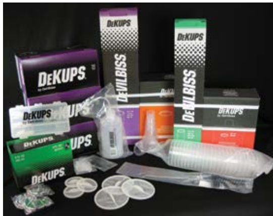
802371 / DPC-650

Adapter for DeVilbissTEKNA/Finishline/Binks (DPC-31, DPC-43), 24 oz. Reusable Sleeve & Lid (1), 24 oz. Disposable Cups & Lids (8), Plugs (5), Disk Filter 125 Micron (4), Barrel Filter 300 Micron (1), Funnel (1), Measuring Guide (1), How-to-Use Guide