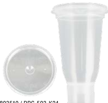
803510 / DPC-503-K24

24 oz. Reusable Sleeve & Lid (3), 9 oz. Reusable Sleeve & Lid (1), 24 oz. Disposable Cups & Lids (32), 9 oz. Disposable Cups & Lids (32), 24/34 oz. Disk Filter 125 Micron (12), 9 oz. Disk Filter 125 Micron (12), Barrel Filter 300 Micron (10), Barrel Filter 600 Micron (10), Funnel (24), 3 oz. Disposable Cups (3), Cleaning Brush, Cleaning Bottle, Magnets (5), How-to-Use Guide