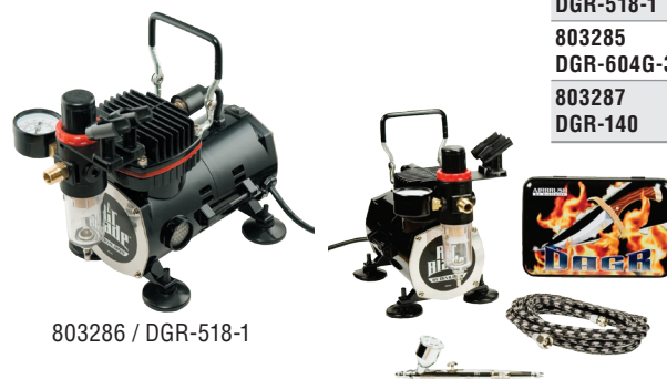
803286 / DGR-518-1